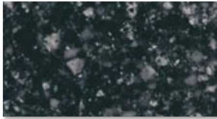
BLACK ICE K3-7100