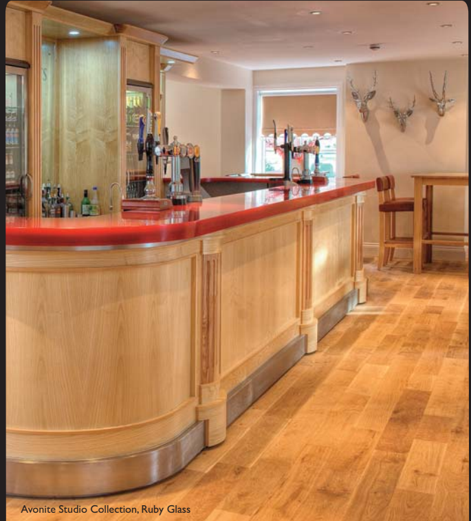
Avonite Studio Collection, Ruby Glass