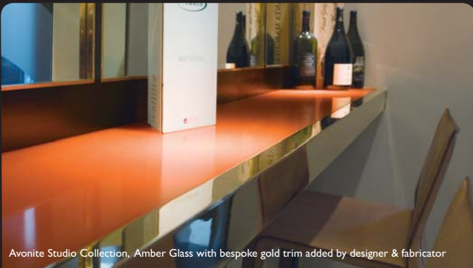
Avonite Studio Collection, Amber Glass with bespoke gold trim added by designer & fabricator