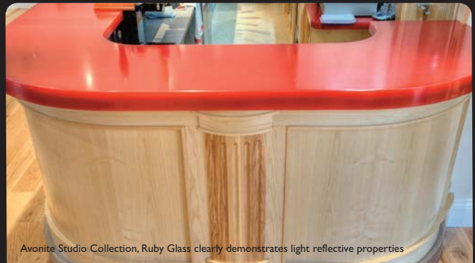
Avonite Studio Collection, Ruby Glass clearly demonstrates light reflective properties