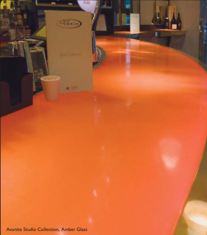
Avonite Studio Collection, Amber Glass